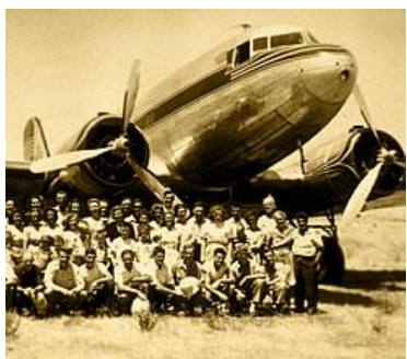
A planeload of early NTM missionaries prepare to go out.

"And because it's biblical, bringing God's Word to unreached people groups is still a priority for NTM today. Just as in the 1930s, men, women and children are born and live and die without an opportunity to know Christ. Will you please pray urgently that God prompts men and women to reach them? And pray that God raises up a vast team of others to pray and give to their work.