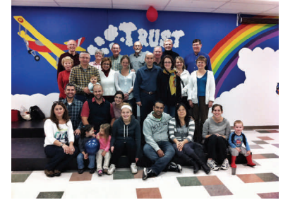
Our new F.I. Appointees