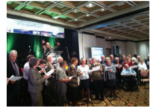
Québec Pioneers at AÉBEQ 40th'