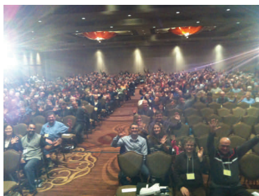
at Fellowship 48