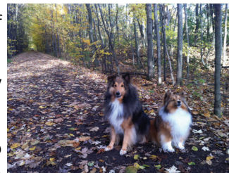
"Scout & Sophie"