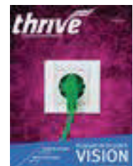
Our new "Thrive" Magazine

Our new National magazine, "Thrive" (formerly Evangelical Baptist), was launched at Fellowship 48. See it online or contact us to have a print version mailed to your door.